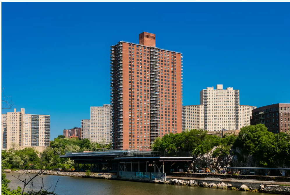
Via Promenade Apartments

BY TANAY WARERKAR | AUG 3, 2017, 12:30PM EDT